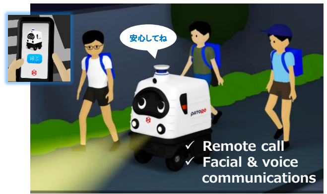
<Escort during night>