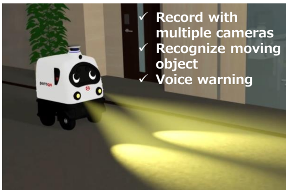
<Patrol in buildings & apartments>