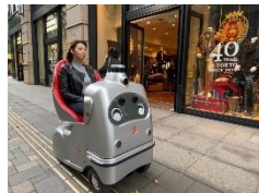
Single-seater robot (Left: City center, Right: Airport)